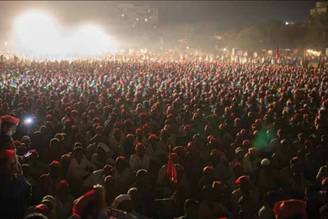
Somaiya Ground, Mumbai.