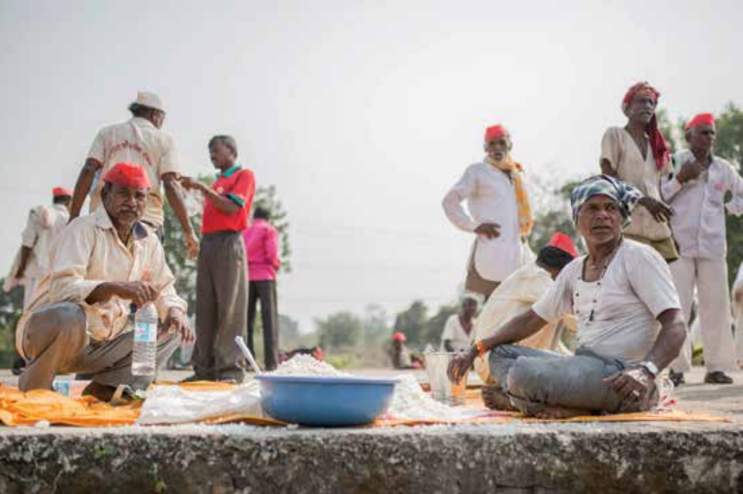
Top: A volunteer serves the marchers. Bottom: Getting lunch ready.