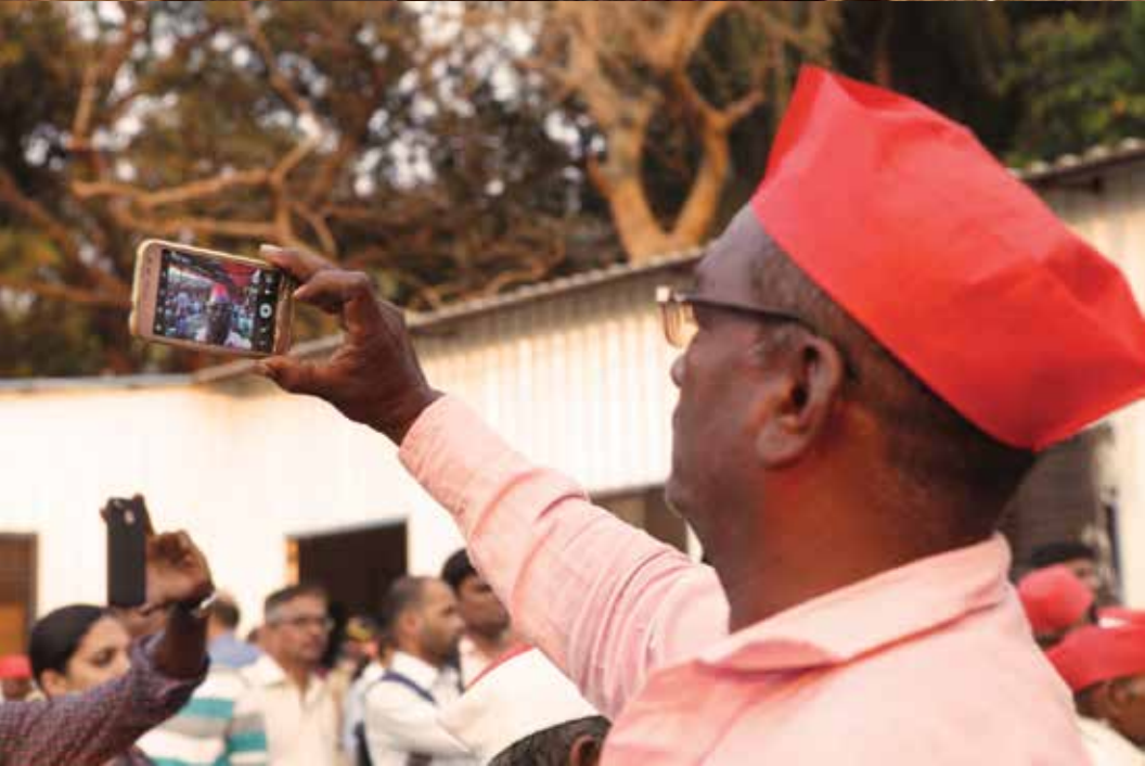
Azad Maidan, Mumbai. Farmers get ready to leave by the night train to Nashik.