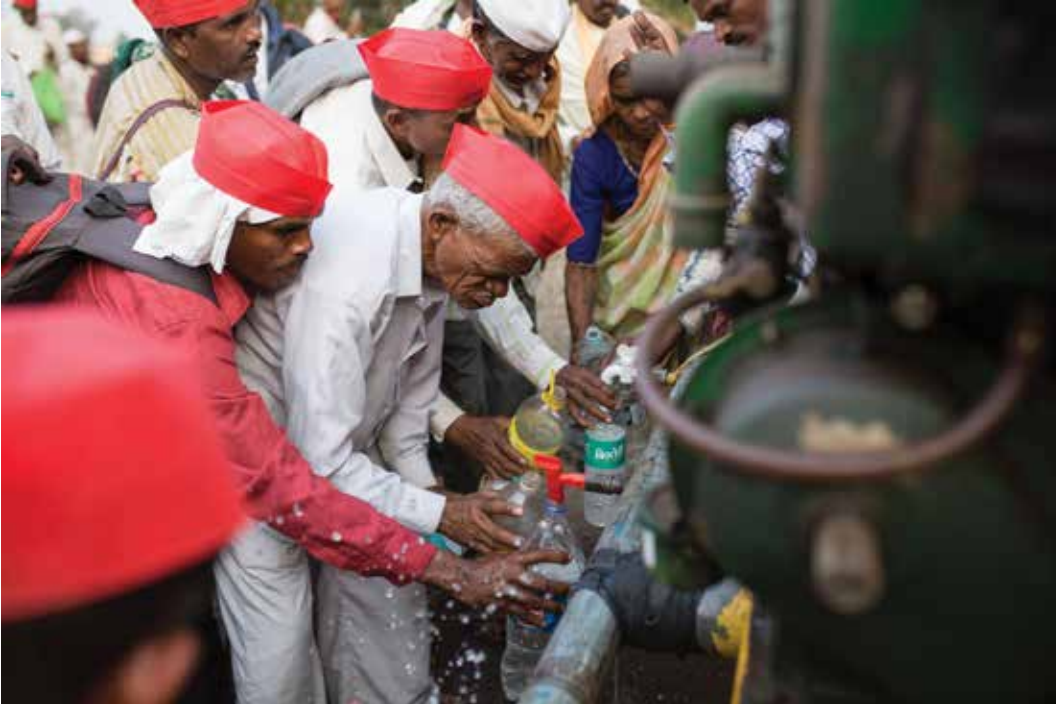
CBS Chowk, Nashik. Fuelling up before the march.