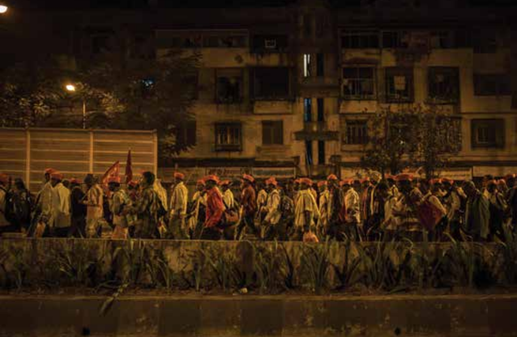
Top: Doctors set up mobile clinic at Somaiya Ground. Bottom: Midnight walk to Azad Maidan.