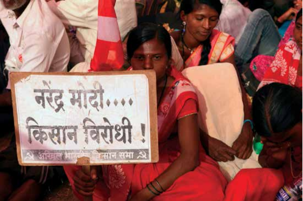
Top: 'Ownership rights to Devasthan [temple] land to the tiller'.