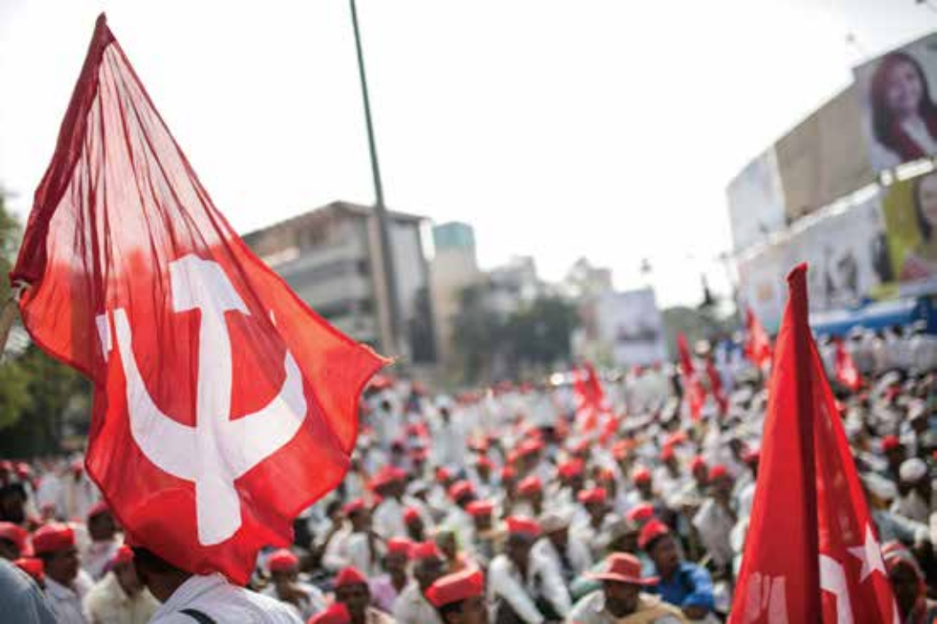
Farmers gather at CBS Chowk, Nashik, Maharashtra, before commencing on the Kisan Long March.