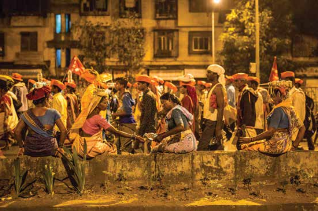
Top: Sleeping en route, after a long and tiring day. Bottom: Midnight walk to Azad Maidan, Mumbai.