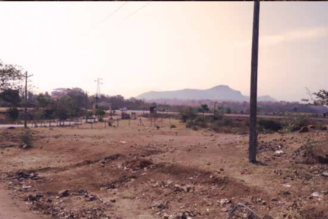
Top: Kisan Long March graffiti on a rock facing the highway en route. Bottom: Igatpuri, where the marchers spent a night in this open space adjacent to the highway.