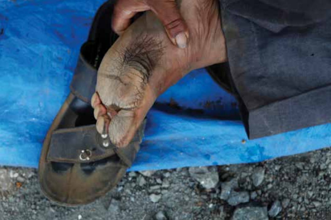
Azad Maidan, Mumbai. After about 80 hours and over 200 km of walking.