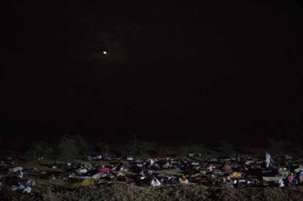
Top: Resting after a hard day of walking. Bottom: Sleeping under the stars.