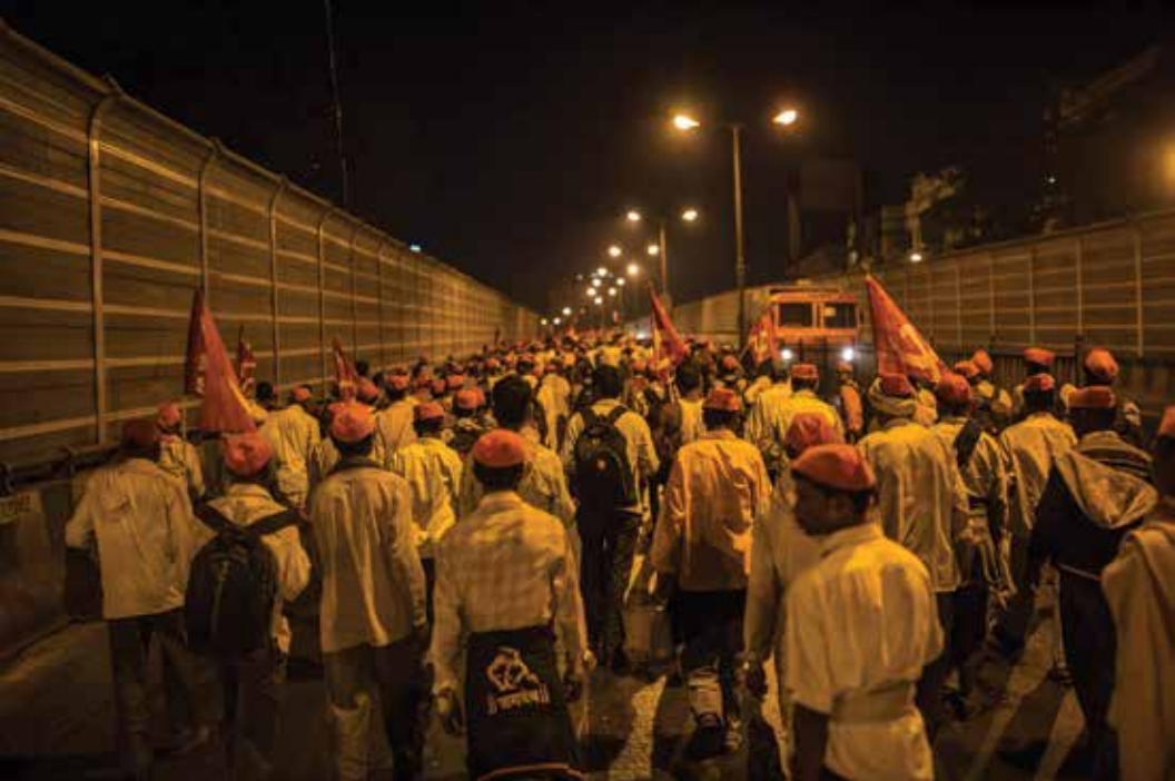
Midnight walk to Azad Maidan, Mumbai.