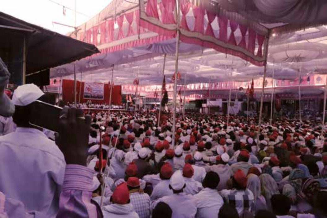
Nearly four hours into the public meeting, farmers listen with full attention.