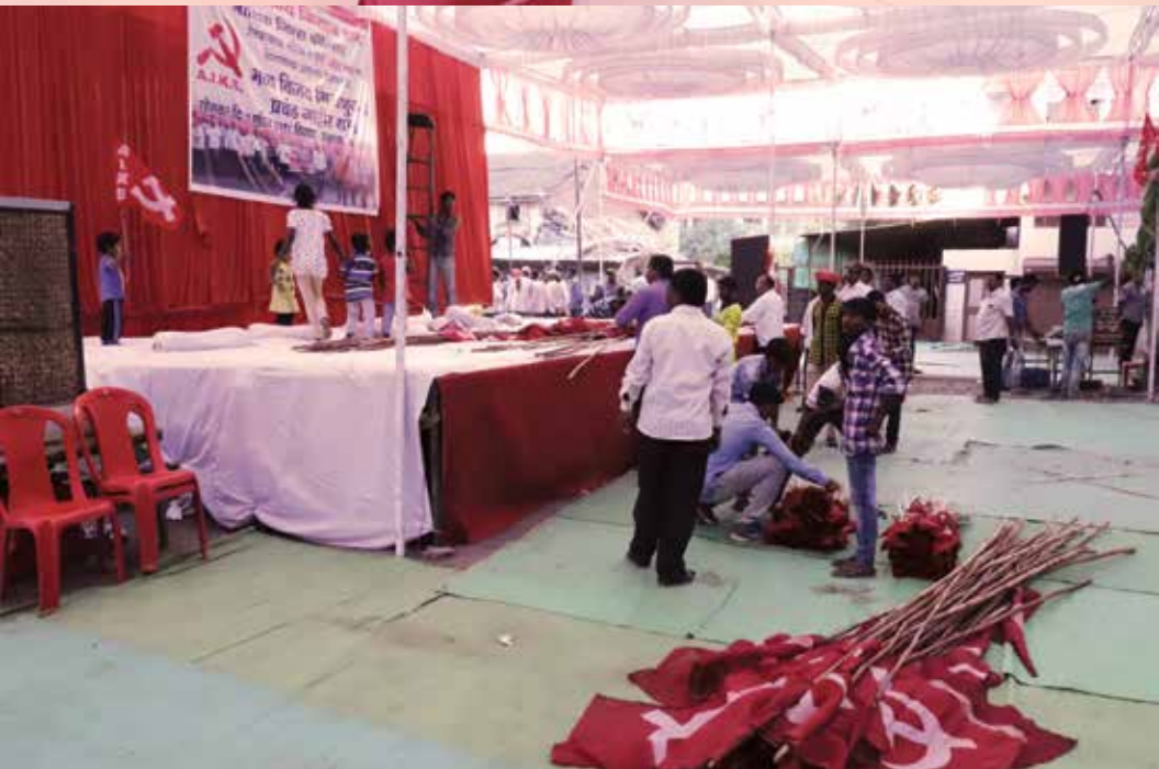
Collecting flags for the battles ahead.