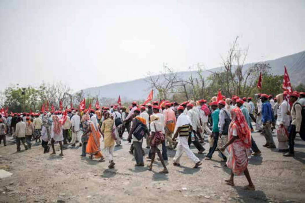
En route to Sonale ground in Bhiwandi.