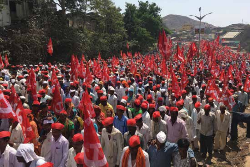
Top: Waiting for the March to commence. Bottom: The Kisan Vijay March is a river of red in Kalwan.